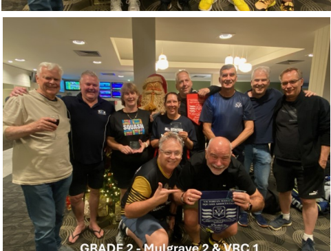
GRADE 2 - Mulgrave 2 & VRC 1