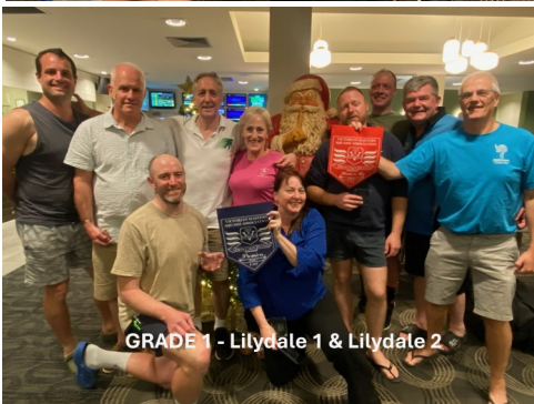
GRADE 1 - Lilydale 1 & Lilydale 2