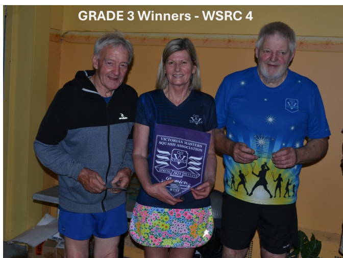
GRADE 3 Winners - WSRC 4