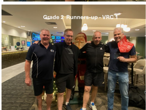
Grade 2 Runners-up - VRC 1