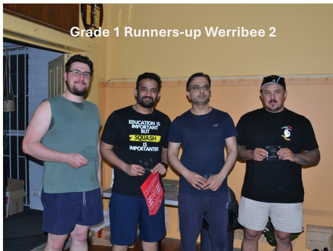
Grade 1 Runners-up Werribee 2