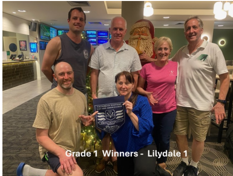
Grade 1 Winners - Lilydale 1