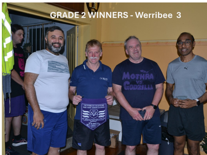
GRADE 2 WINNERS - Werribee 3