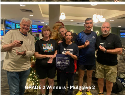
GRADE 2 Winners - Mulgrave 2