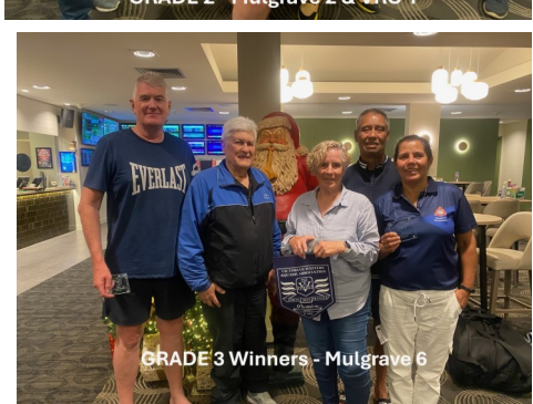
GRADE 3 Winners - Mulgrave 6