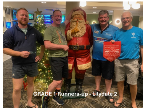
GRADE 1 Runners-up - Lilydale 2