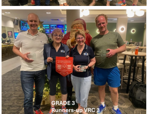
GRADE 3 Runners-up VRC 3