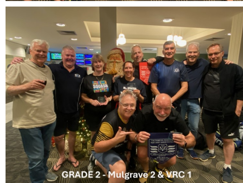
GRADE 2 - Mulgrave 2 & VRC 1