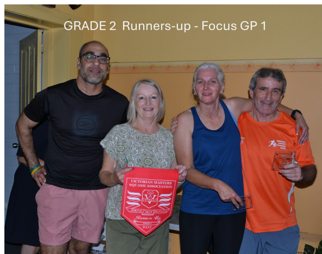
GRADE 2 Runners-up - Focus GP 1