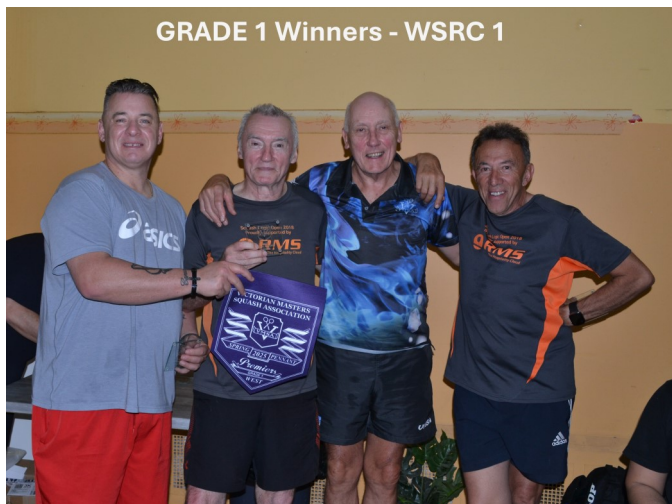
GRADE 1 Winners - WSRC 1