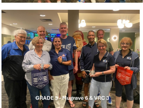
GRADE 3 - Mulgrave 6 & VRC 3