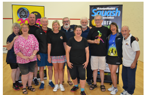
A great representation from WSRC