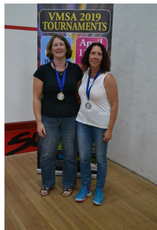
Womens 50-54 Open