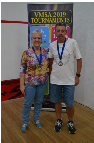
Mens 50-54 Div 2