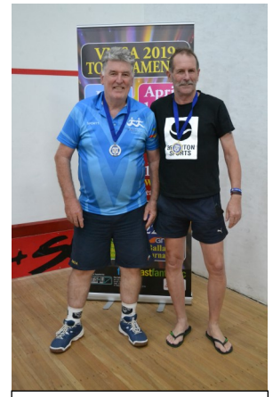
Mens 65-69 Div 2