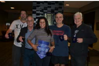
Grade 5 Winners Brighton Rec