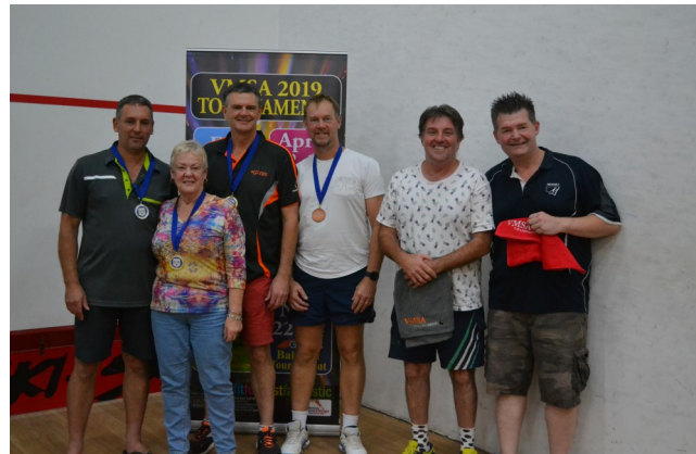
Mens 50-54 Open