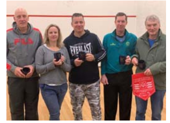
Grade 2 Runners Up Squash Logic