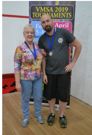
Mens 45-39 Div 2