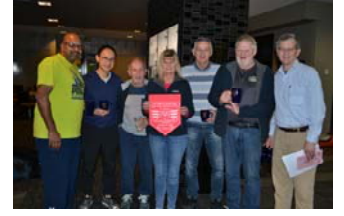
Grade 4 Runners-up Squash Logic