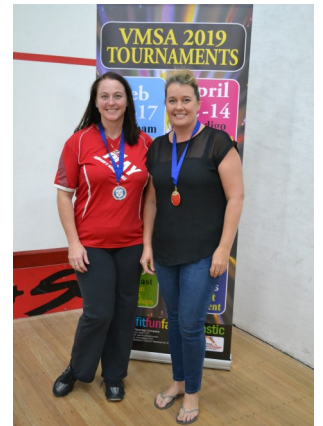
Womens 45-49 Open