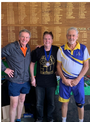
Mens 70-74 Open