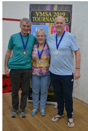
Mens 65-69 Open