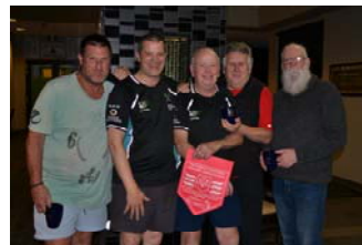
Grade 9 Runners-Up Moorabbin