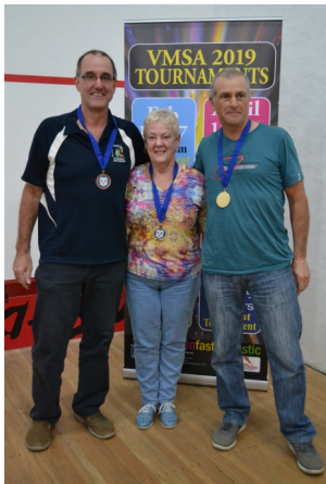
Mens 60-64 Open