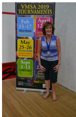
Womens 55-59 Open