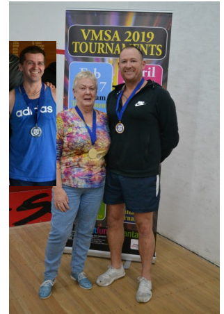
Mens 40-44 Div 2