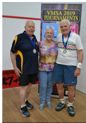
Mens 80-84 Open