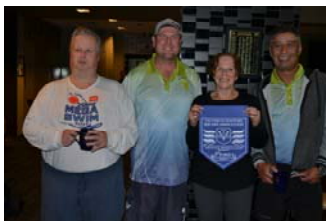
Grade 9 Winners Brighton Rec