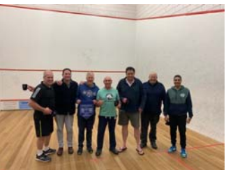
Grade 7 Winners Westerfolds