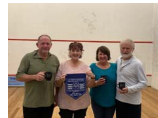
Grade 8 Winners Squash Logic