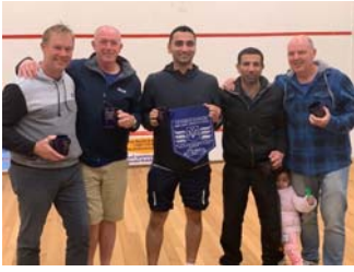
Grade 1 Winners Brighton Rec