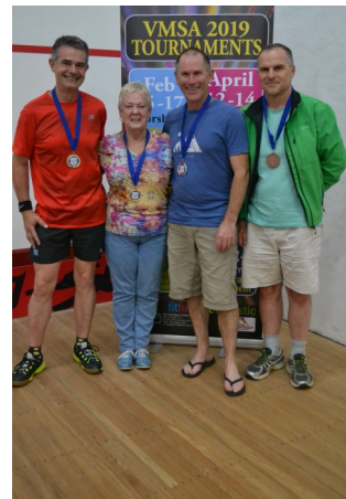
Mens 55-59 Div 2