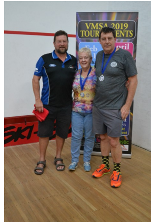
Mens 60-64 Div 2