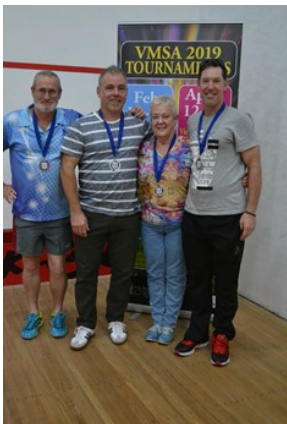
Mens 45-49 Open