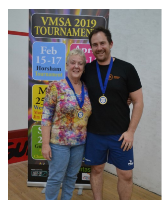
Womens 70-74 Open