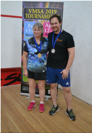
Mens 35-39 Open