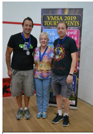
Mens 40-44 Open