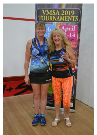
Womens 55-59 Div 2