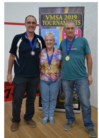
Mens 55-59 Div 2