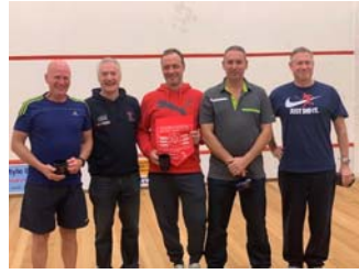
Grade 1 Runners Up Lilydale