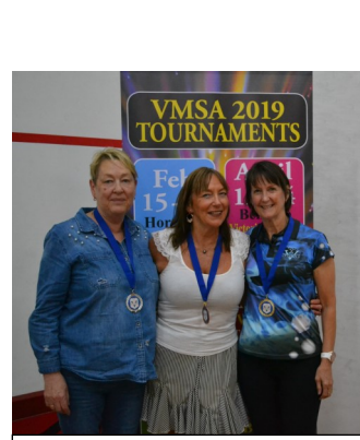
Womens 65-69 Open