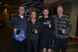
Grade 3 Winners Mt Districts