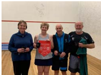
Grade 7 Runners Up Moorabbin