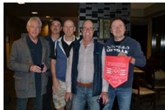
Grade 5 Runners-up Mulgrave