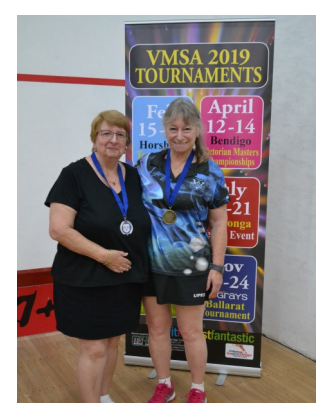
Womens 65-69 Div 2