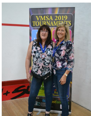
Womens 60-64 Open