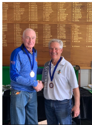
Mens 75-79 Open