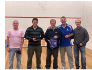
Grade 6 Winners Werribee