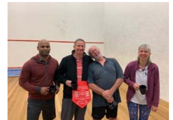
Grade 6 Runners-up Westerfolds