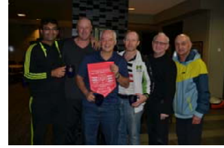
Grade 3 Runners Up Westerfolds