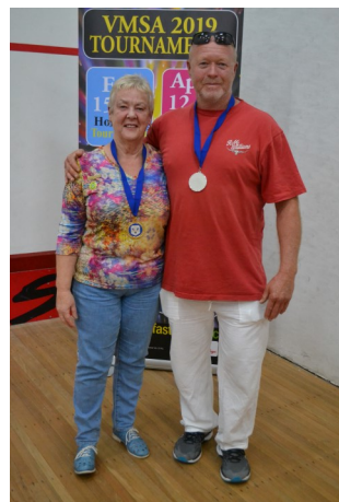
Mens 55-59 Open