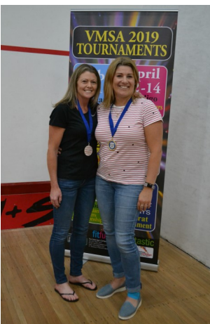
Womens 45-49 Div 2