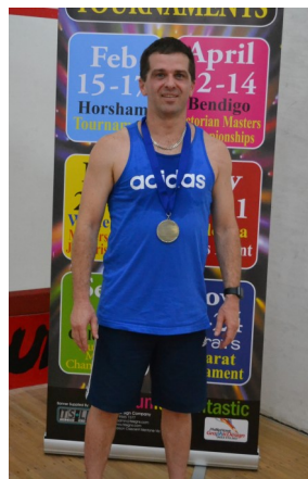
Mens 35-39 Div 2