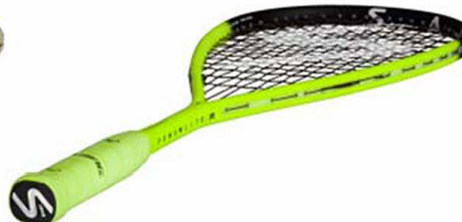
SALMING CANNONE POWERLITE