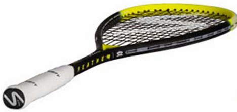
SALMING GRIT FEATHER