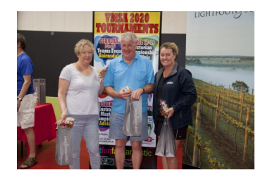
SECTION 5 WINNERS ALL THE PREZ'S MEN