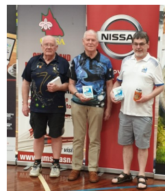
Division 14 R/up