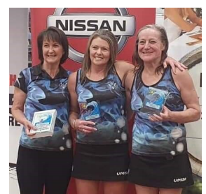
Division 16 Winners