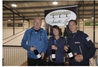
Section 2 R-Up ONE WOODY & TWO NUTS