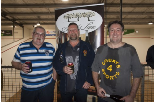
Section 3 R/Up MURPH'S MUPPETS