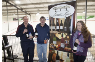
Section 6 R/up GMH