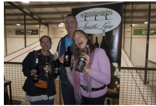
Section 2 Winners TO TANGO