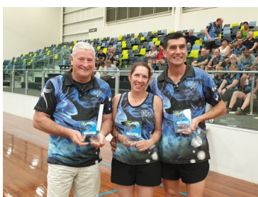
Division 10 R/Up