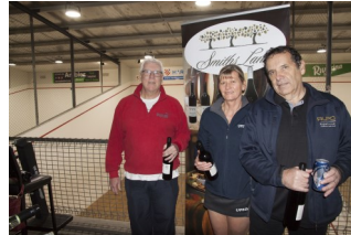
Section 4 R-Up BOSS LADY'S BOYS