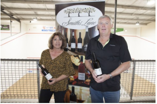
Section 5 Third ANTIQUES ROADSHOW