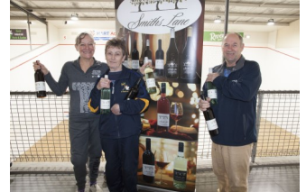
Section 5 Winners WTF'S