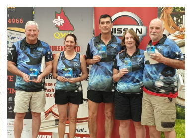
Division 10 Winners