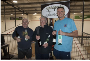
Section 1 Winners SCULLYBUTT