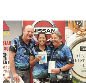
Division 7 Winners