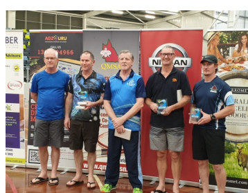
Division 5 R/up