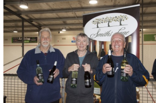
Section 4 Winners CLEM'S CLOMPERS