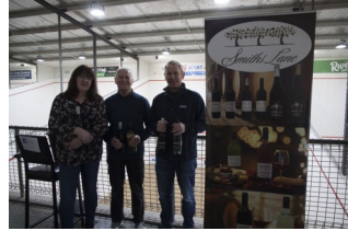
Section 6 Winners PISSED & BROKEN