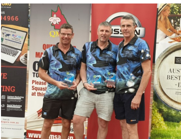
Division 2 Winners