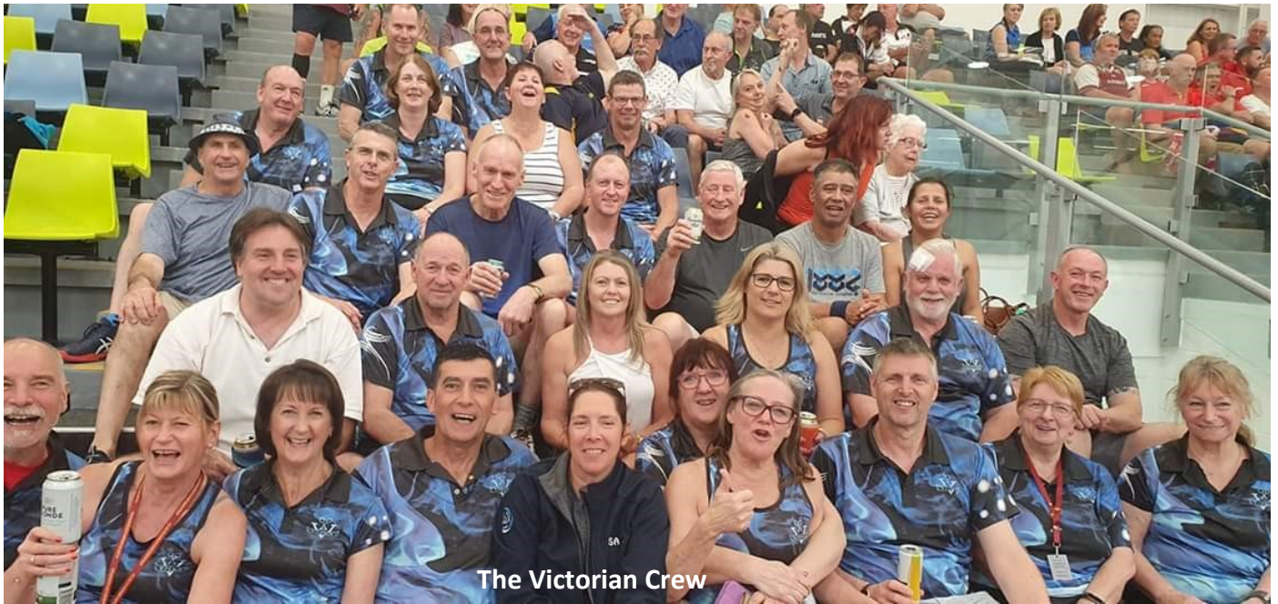
The Victorian Crew