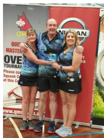
Division 13 Winners