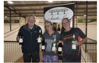
Section 3 Winners MAD HATTERS