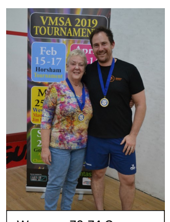
Womens 70-74 Open