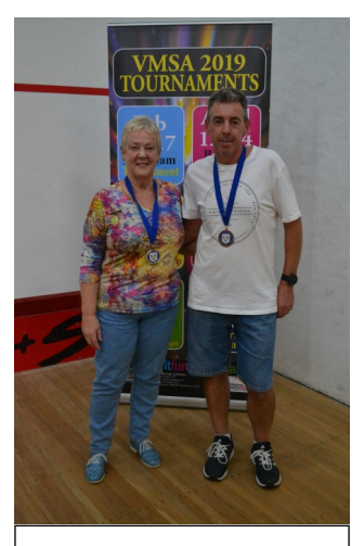
Mens 50-54 Div 2