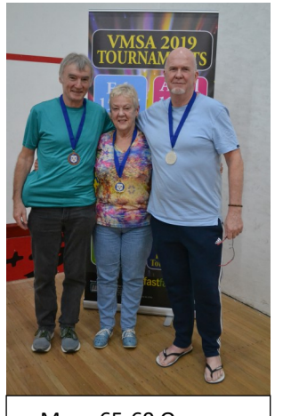
Mens 65-69 Open