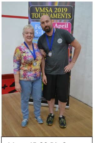
Mens 45-39 Div 2