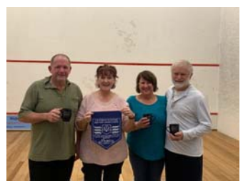
Grade 8 Winners Squash Logic