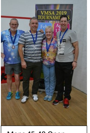
Mens 45-49 Open