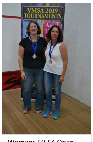
Womens 50-54 Open