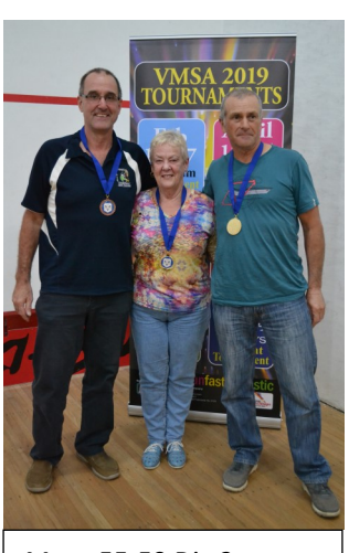
Mens 55-59 Div 2