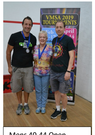
Mens 40-44 Open