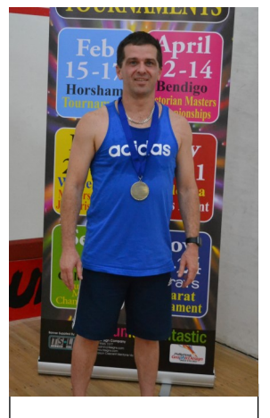
Mens 35-39 Div 2