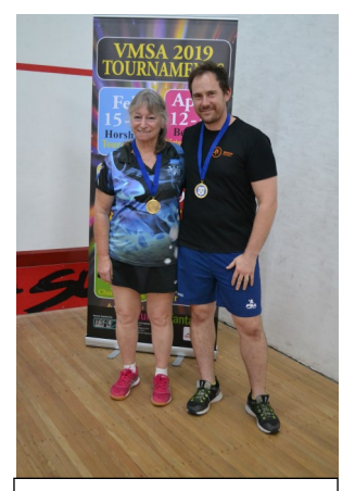
Mens 35-39 Open