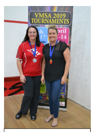
Womens 45-49 Open