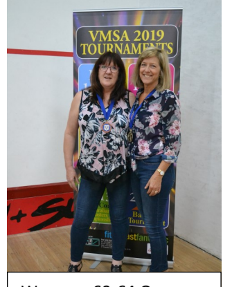
Womens 60-64 Open