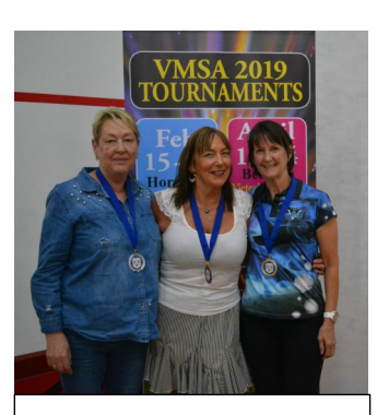
Womens 65-69 Open