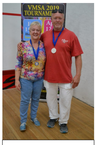
Mens 55-59 Open