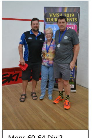
Mens 60-64 Div 2