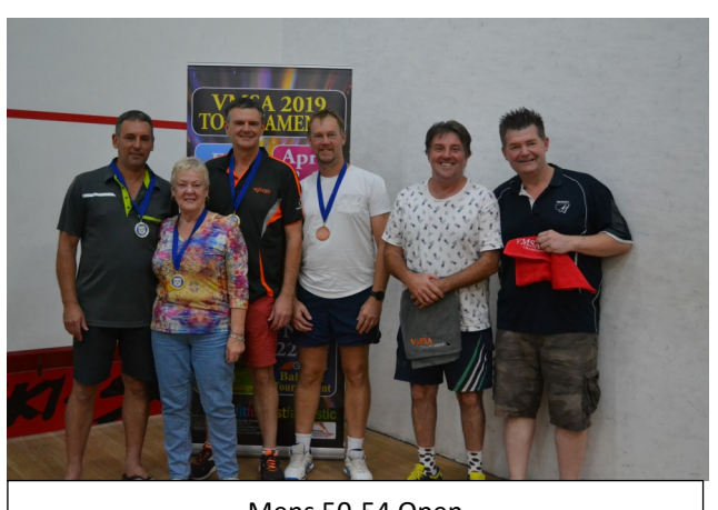
Mens 50-54 Open