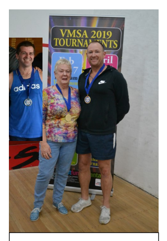
Mens 40-44 Div 2