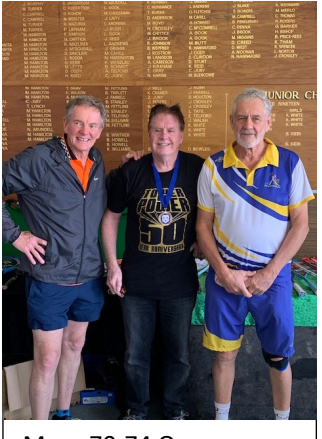
Mens 70-74 Open