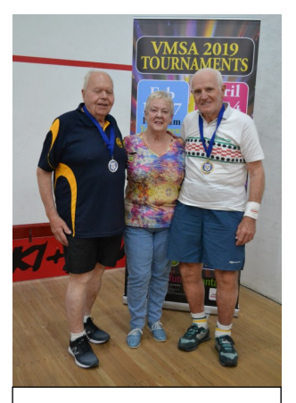
Mens 80-84 Open