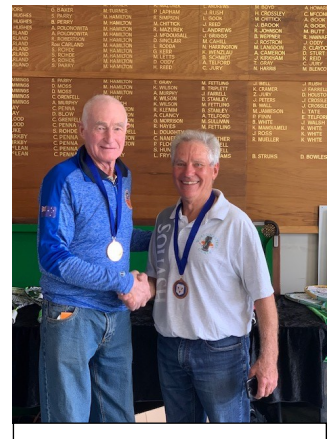
Mens 75-79 Open