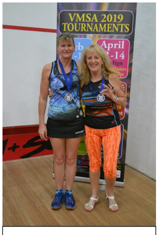
Womens 55-59 Div 2