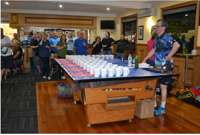
Grade 5 Winners—PEGS and R-up Brighton Rec