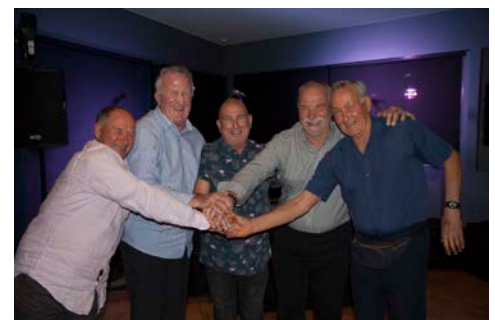
The '100 Tournament Club'