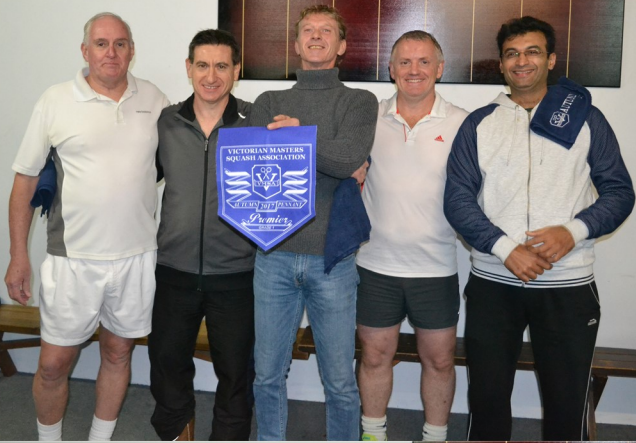
Grade 1 Winners - Knox