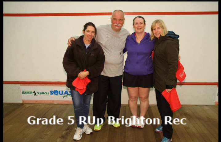
Grade 5 RUP Brighton Rec