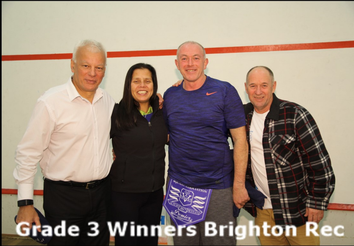
Grade 3 Winners Brighton Rec