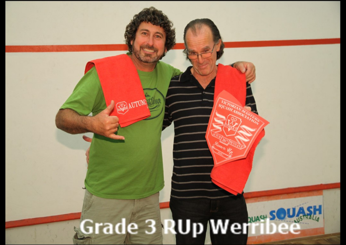
Grade 3 RUP Werribee