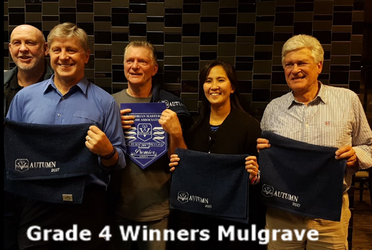
Grade 4 Winners Mulgrave