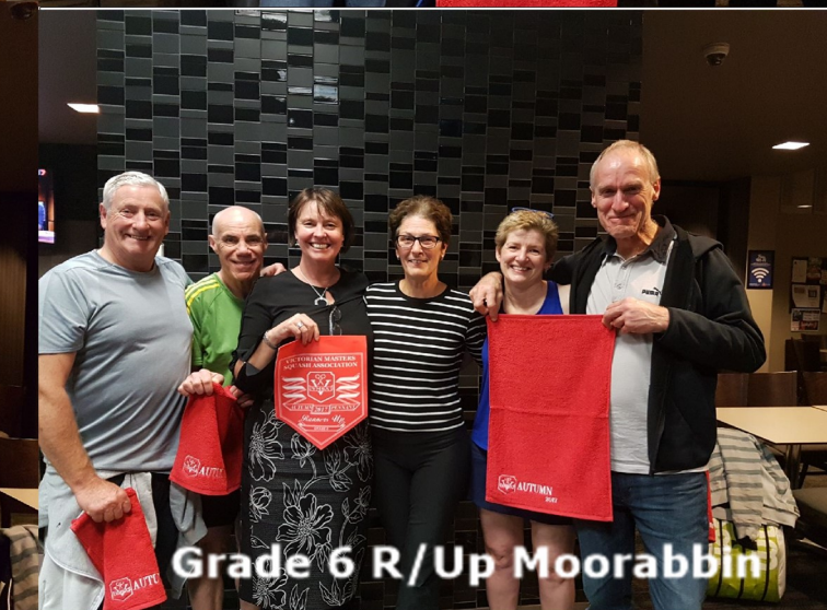
Grade 6 R/Up Moorabbin