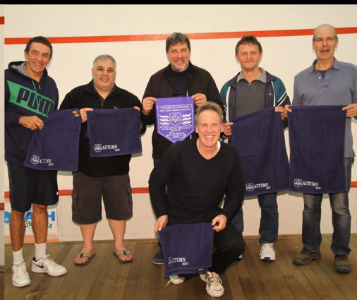
Grade 9 Winners Mulgrave