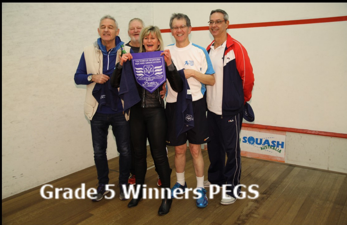
Grade 5 Winners PEGS