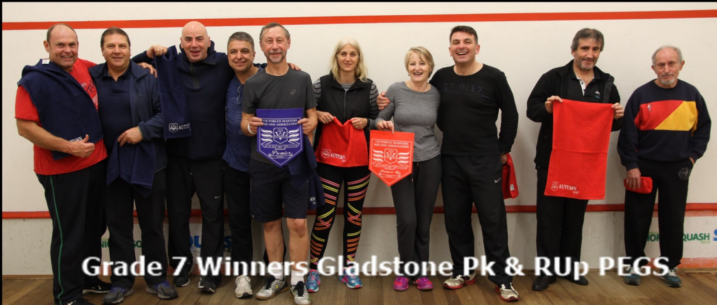
Grade 7 Winners Gladstone Pk & RUP PEGS