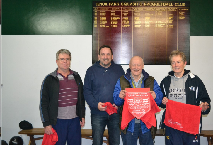
Grade 10 RUp - Mt Districts