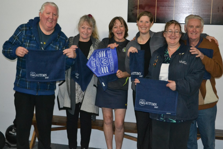
Grade 10 Winners - PEGS