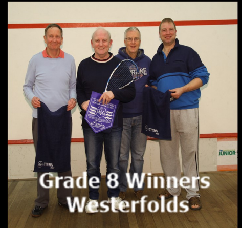
Grade 8 Winners Westerfolds