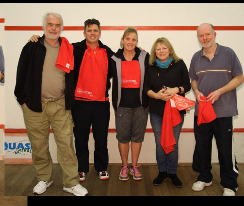
Grade 9 RUP Mulgrave