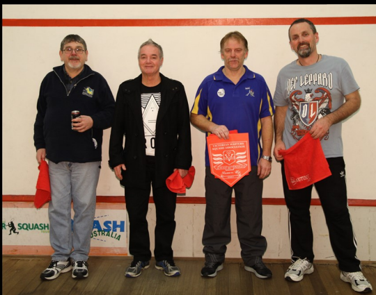
Grade 8 R/Up Werribee