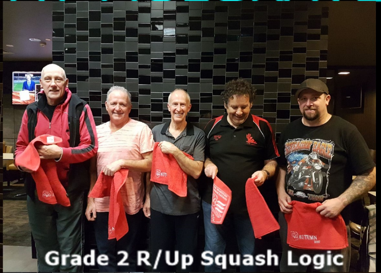
Grade 2 R/Up Squash Logic