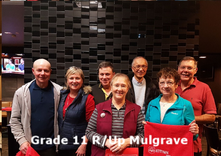
Grade 11 R/Up Mulgrave