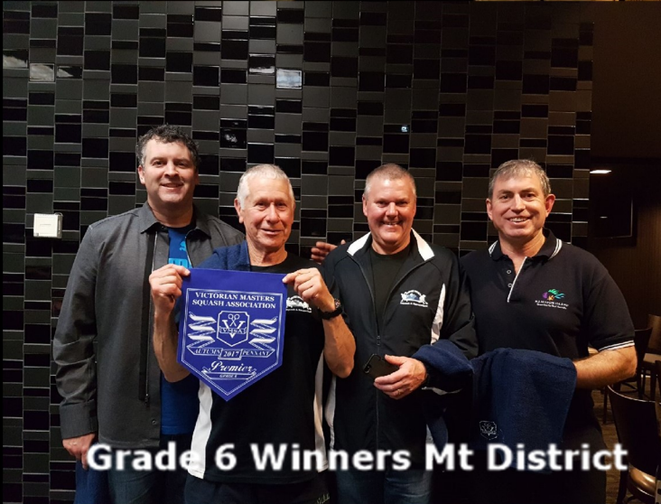
Grade 6 Winners Mt District