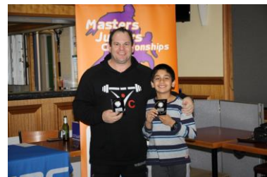
Section 11 R/Up