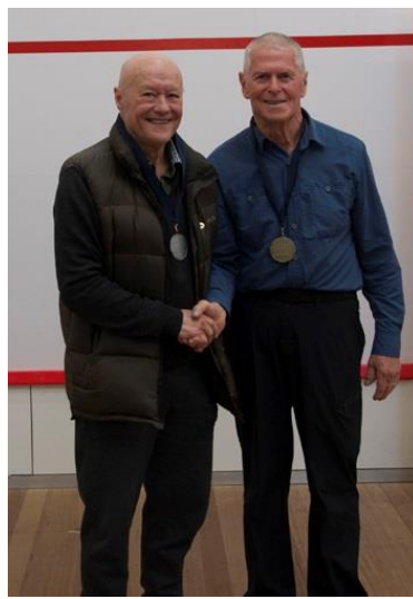
Event 10 (1)