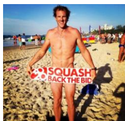
Any volunteers to do this for squash?

Speaking of courts closing, Toowoomba courts are also fighting demolition plans. They were promoting squash for the 2020 Olympics, but as that effort was lost to wrestling, they are now looking towards 2024. .