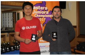
Section 2 R/Up