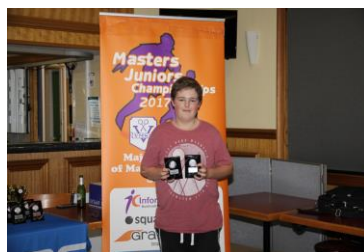
Section 13 R/Up