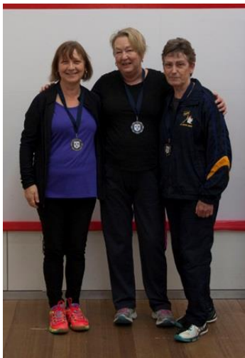
Event 14 (1)