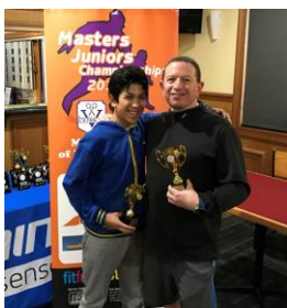
Section 11 Winners