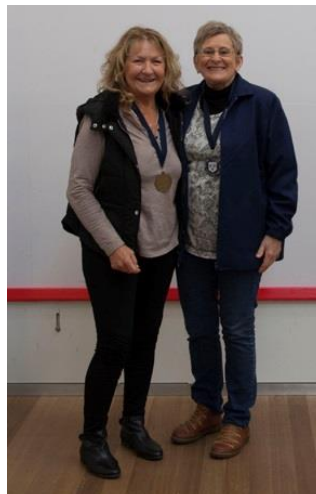
Event 14 (2)