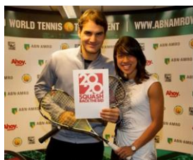
Federer loves squash too! He was fighting to get it included in the 2020 Olympics!