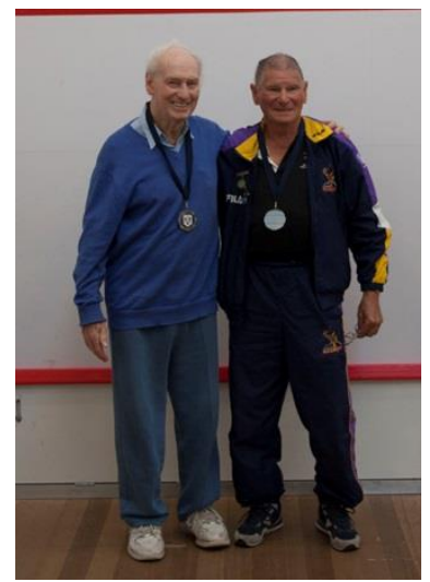
Event 10 (2)