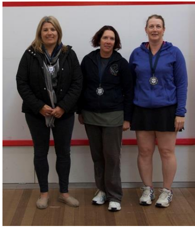
Event 11 (2)