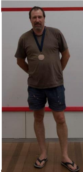
Event 2 (2)