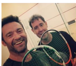
Hugh Jackman loves a game of squash when he visits Toowoomba.

Without wider promotion of our great sport, more courts will close and this great game will be lost to most local players as the travel time to courts is prohibitive.