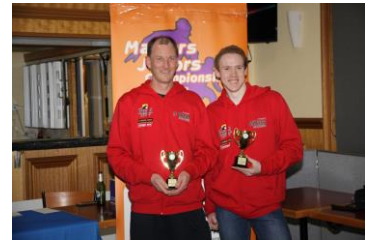
Section 2 Winners