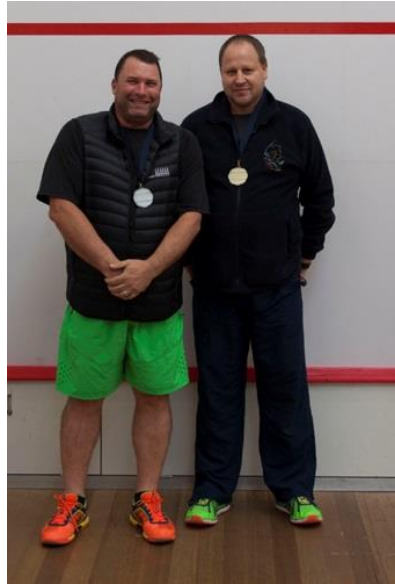
Event 2 (3)