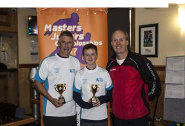
Section 13 Winners