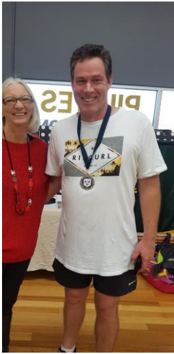
Event 2 (1)