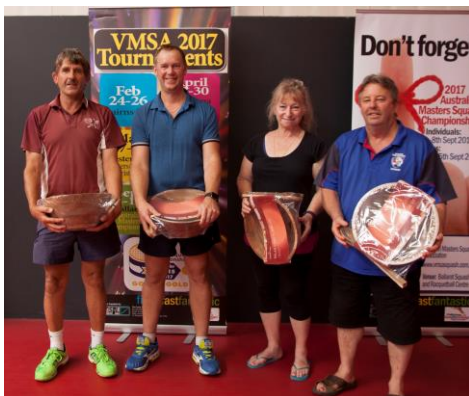
Section 1 Winners - City Bumkins