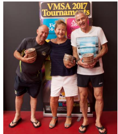
Section 3 R/up The Crappers