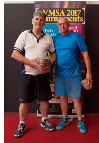
Section 5 R/up - Dazzanators - 1