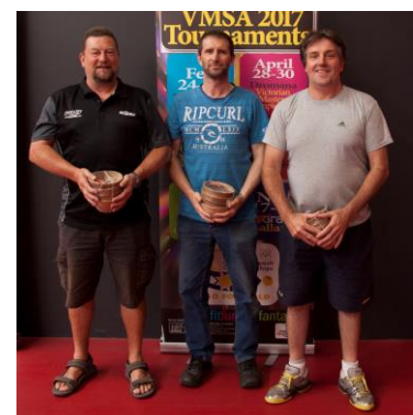
Section 2 R/up - Meatloaf