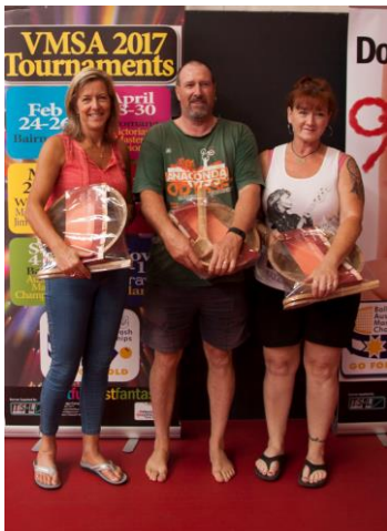
Section 5 Winners - Bidy's Bitches