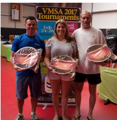
Section 2 Winners - Dougies Fat Rara