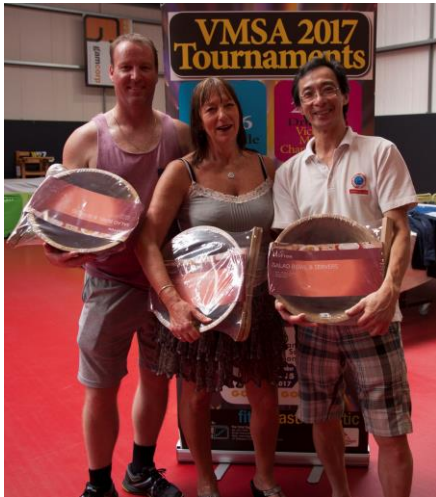
Section 3 Winners - TNT