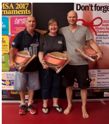
Section 4 Winners - NQR