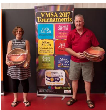
Section 6 Winners - Old Timers