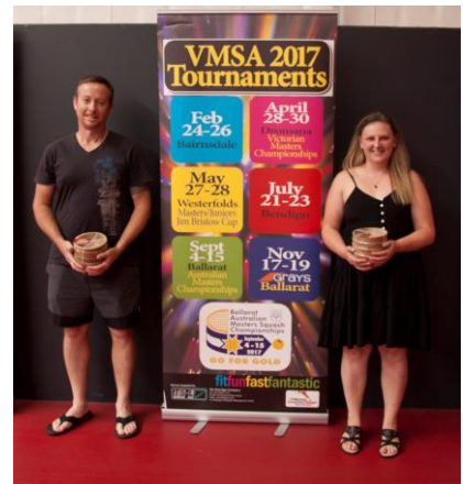
Section 4 R/up - Virgin on the Ridiculous