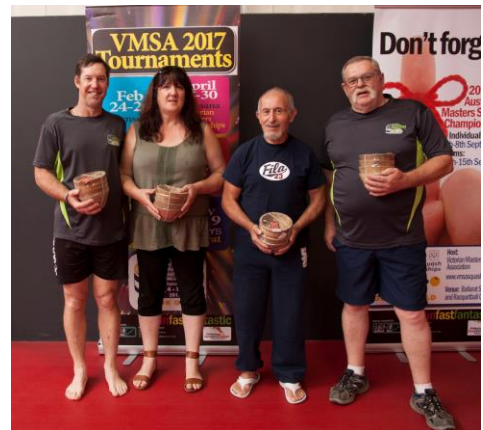
Section 1 R/up Frosty I'ties