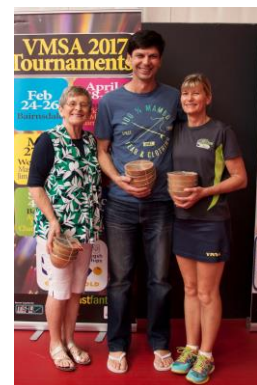
Section 6 R/up - The Missing SJs