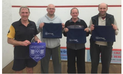
GRADE 5 PREMIERS