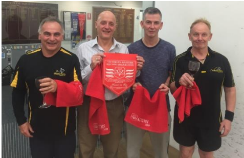
GRADE 3 RUNNERS UP