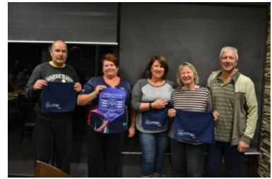
GRADE 8 PREMIERS