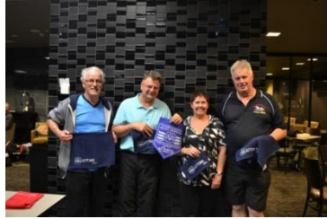
GRADE 10 PREMIERS