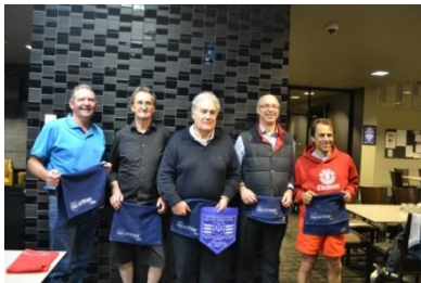
GRADE 7 PREMIERS