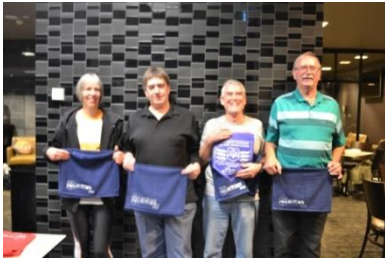
GRADE 9 PREMIERS