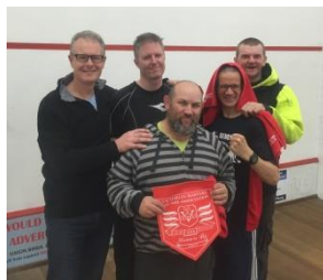
GRADE 4 RUNNERS UP