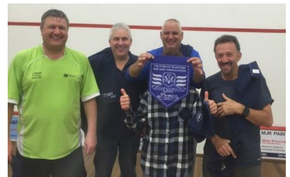
GRADE 4 PREMIERS