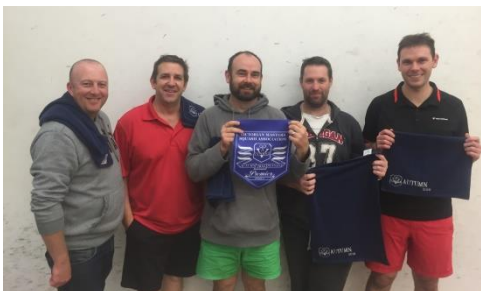
GRADE 2 PREMIERS