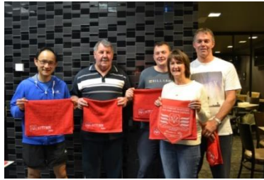
GRADE 8 RUNNERS UP