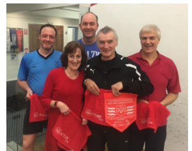
GRADE 2 RUNNERS UP