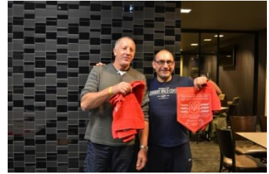
GRADE 9 RUNNERS UP