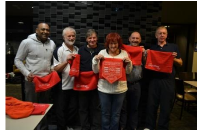
GRADE 7 RUNNERS UP