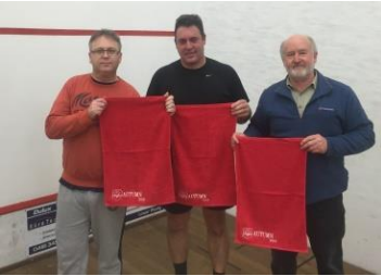
GRADE 5 RUNNERS UP