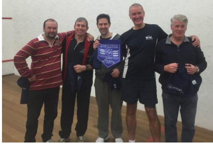
GRADE 6 PREMIERS