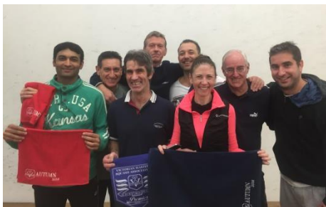
GRADE 1 RUNNERS UP