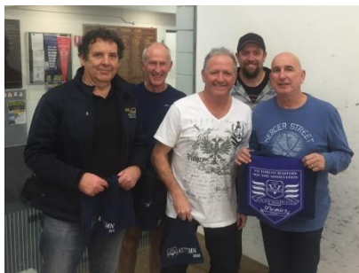
GRADE 3 PREMIERS