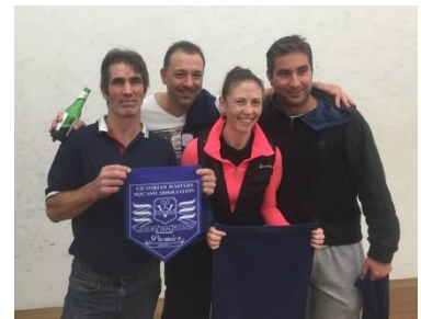
GRADE 1 PREMIERS