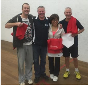
GRADE 6 RUNNERS UP