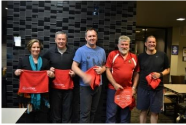
GRADE 10 RUNNERS UP