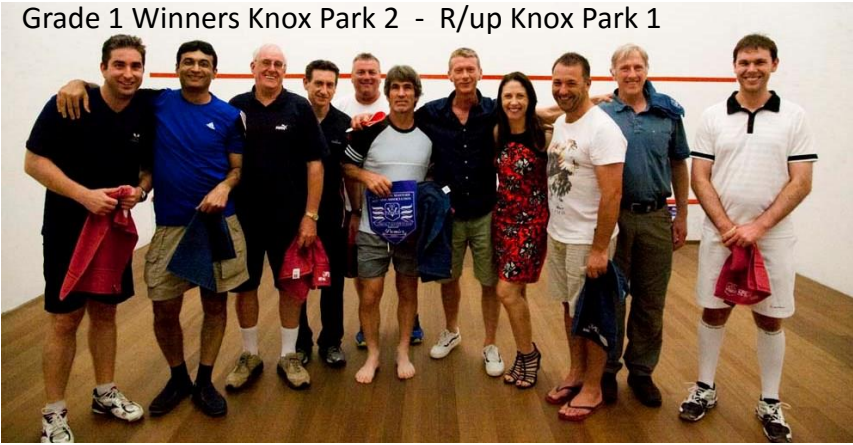
Grade 1 Winners Knox Park 2 - R/up Knox Park 1