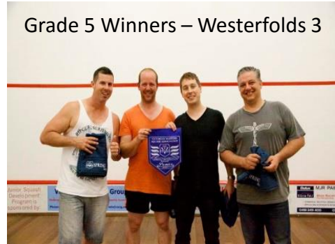
Grade 5 Winners - Westerfolds 3