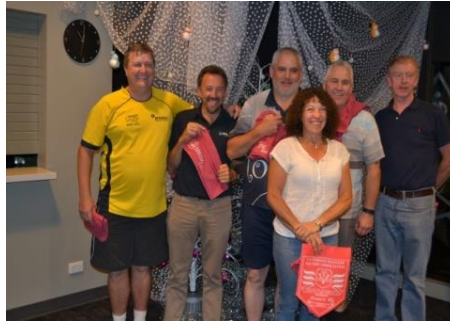
Grade 4 R/Up - Squash Logic 2