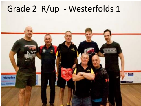
Grade 2 R/up - Westerfolds 1