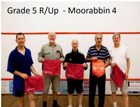
Grade 5 R/Up - Moorabbin 4