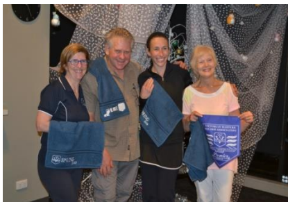
Grade 10 Winners - Mt Districts 7