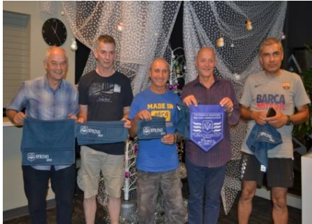
Grade 4 Winners - Westerfolds 2