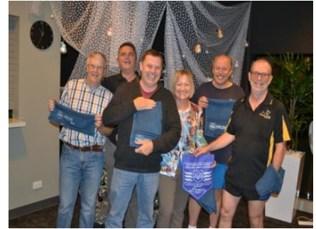
Grade 8 Winners - Westerfolds 7