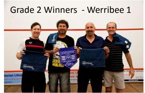
Grade 2 Winners - Werribee 1