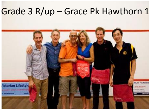
Grade 3 R/up - Grace Pk Hawthorn 1