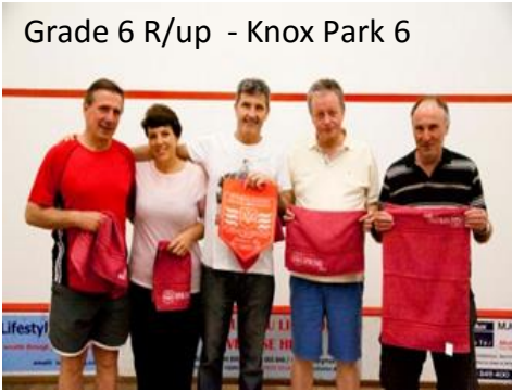
Grade 6 R/up - Knox Park 6