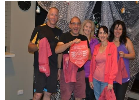
Grade 9 R/up - Westerfolds 8