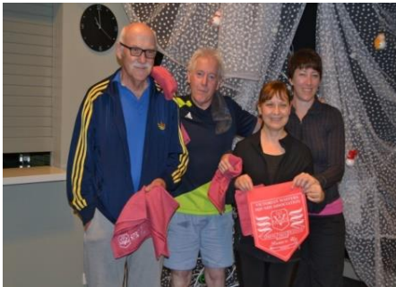
Grade 8 R/Up - Mulgrave 6