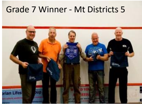
Grade 7 Winner - Mt Districts 5