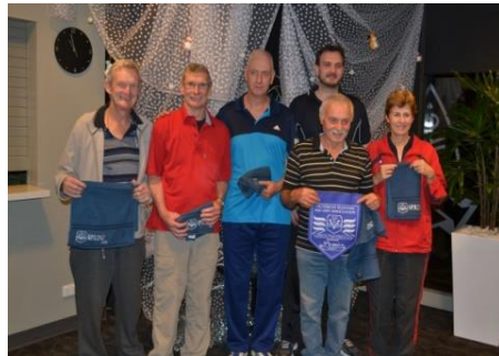
Grade 9 Winners - Knox Park 8