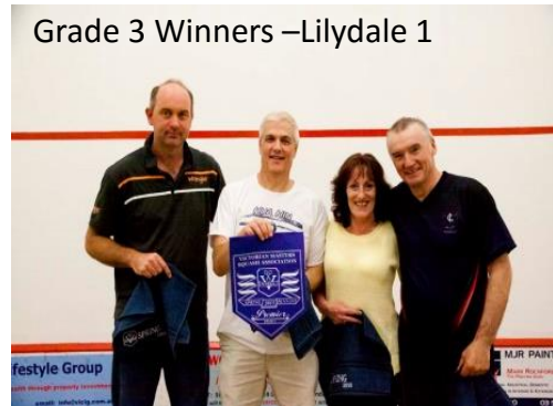
Grade 3 Winners - Lilydale 1