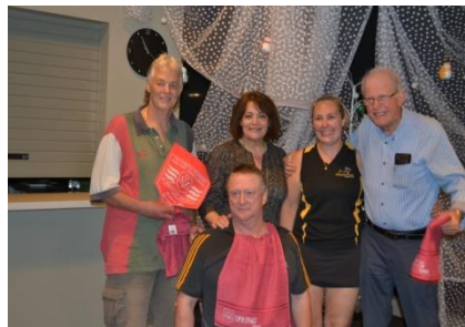
Grade 10 R/up - Westerfolds 9