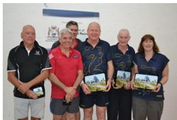
Division 7 Winners