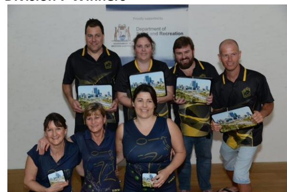
Division 14 Runners-Up