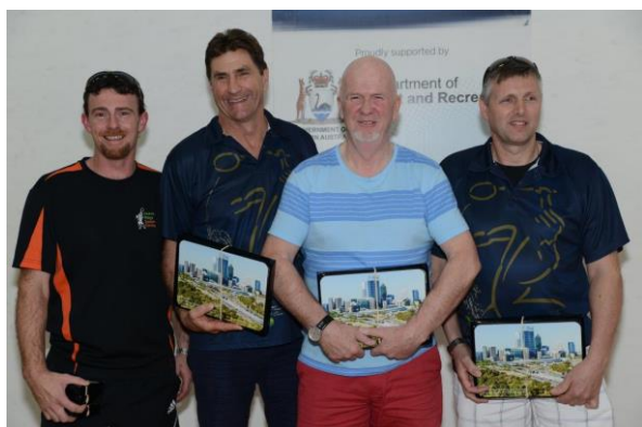
Division 3 Winners