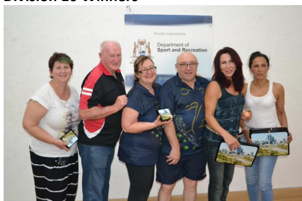
Division 17 Runners-up