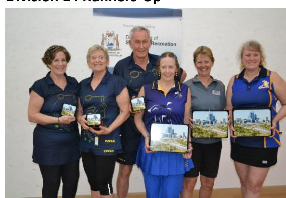
Division 18 Runners Up