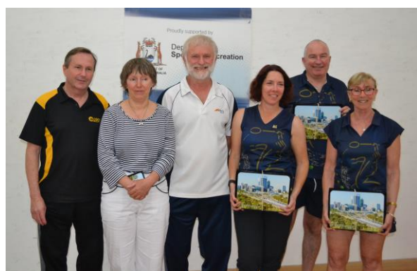
Division 10 Winners