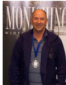
MENS 55-59 OPEN