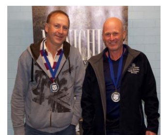
MENS 50-54 OPEN