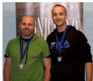
MENS 40-44 DIV 2