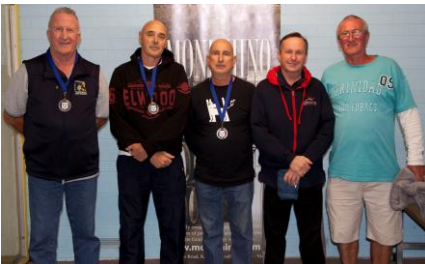
MENS 60-64 DIV 3