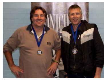
MENS 50-54 DIV 2