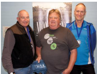
MENS 55-59 DIV 3