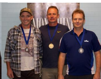
MENS 45-49 DIV 2