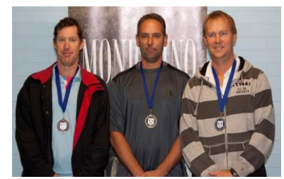
MENS 45-49 OPEN