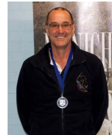
MENS 60-64 OPEN