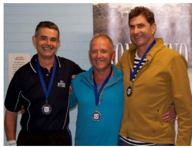
MENS 50-54 DIV 3