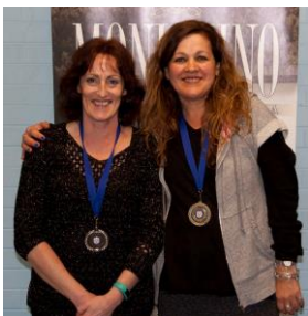
WOMENS 50-54 OPEN