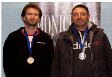
MENS 45-49 DIV 3