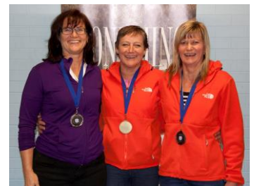
WOMENS 50-54 DIV 2