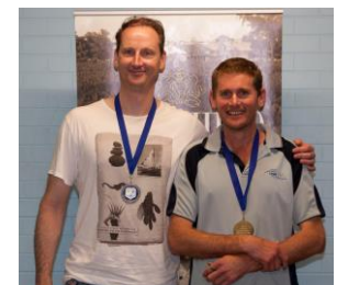
MENS 40-44 OPEN