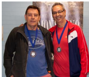
MENS 55-59 DIV 2