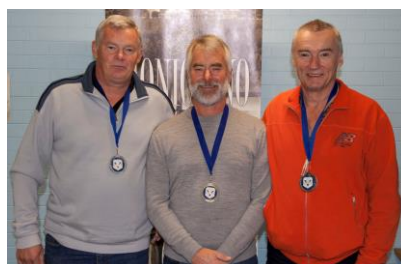
MENS 60-64 DIV 2