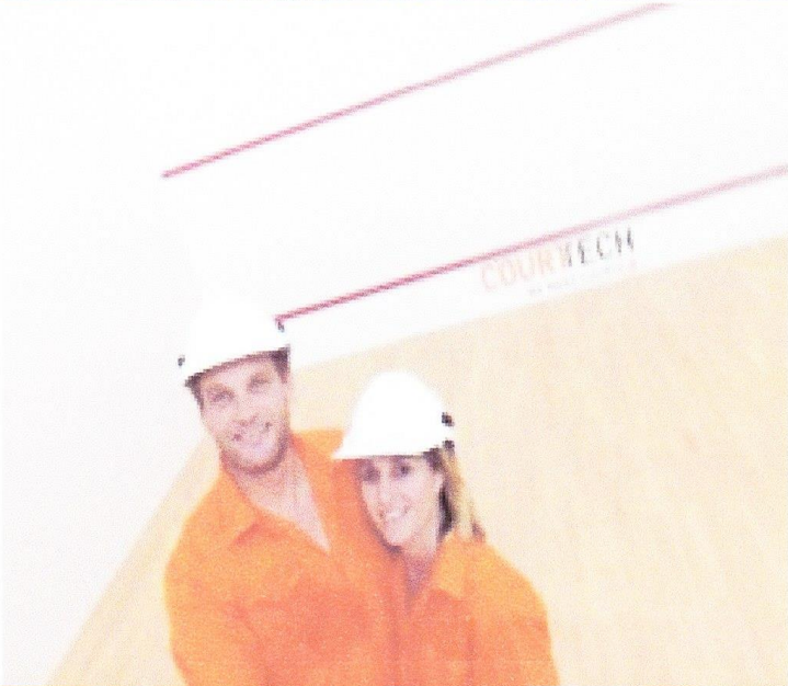
Next Generation - Canberra