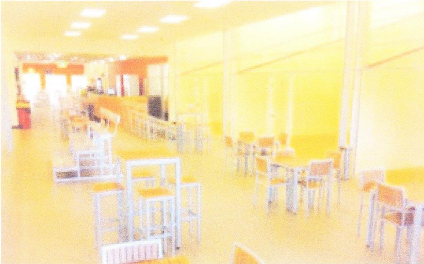
Darwin Squash Centre

and myself hope to have a positive impact on the squash community. Hopefully in the near future CourtTech will have built the courts the masters players will play major championship events.