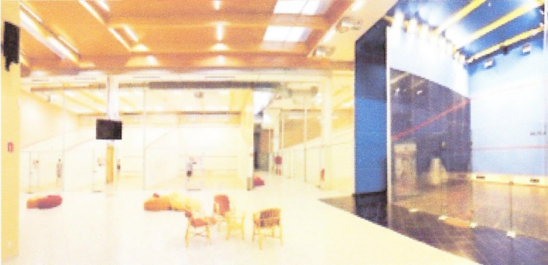
Hasta La Vista - Poland