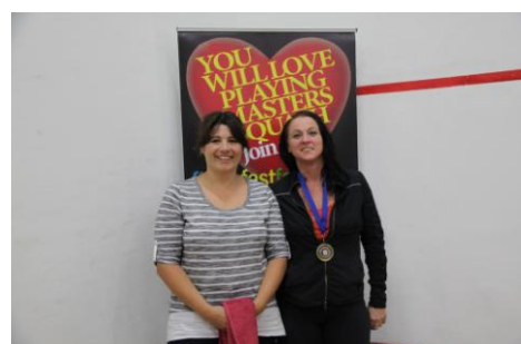
W 40-44 Open