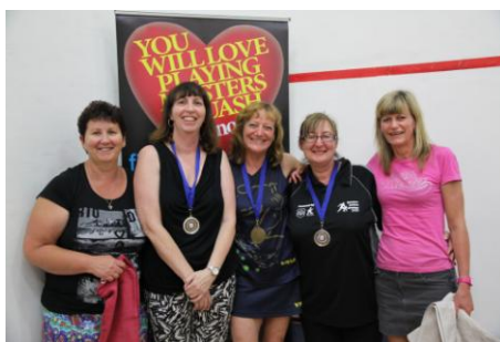
W 50-54 Open