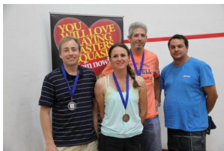
M & L 35-39 Open