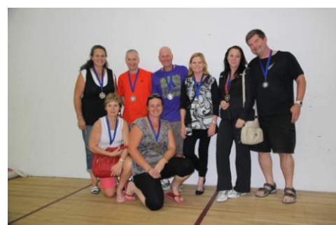
Winners are grinners