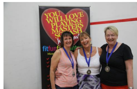
W60-64 Div 2