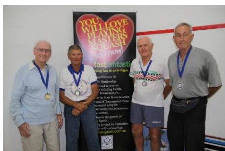
M75-79, 80-84, 85-89