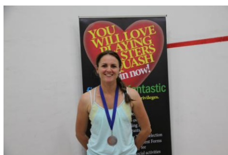
W 35-39 Open