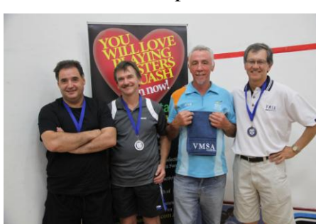
M 55-59 Div 2