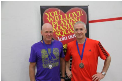
M 50-54 Open