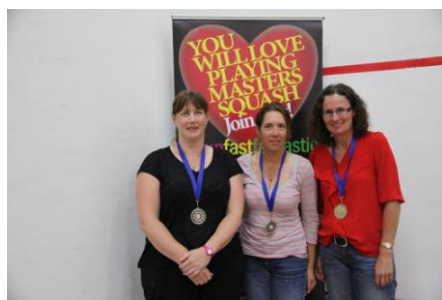
W 45-49 Open