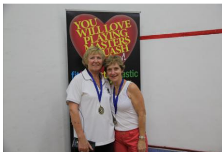
W 60-64 Open