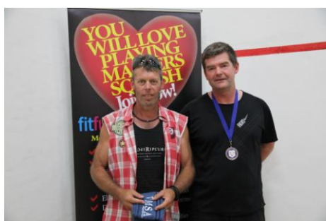
M 45-49 Div 2