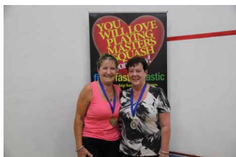
W 65-69 Div 2