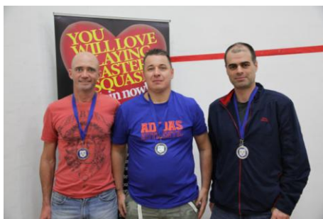
M 40-44 Open