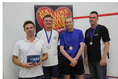
M 45-49 Open