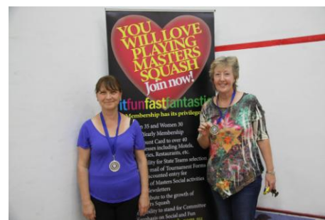
W 55-59 Div 2