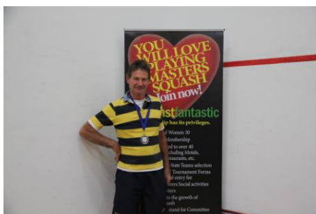
M 65-69 Open