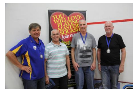
M 60-64 Open