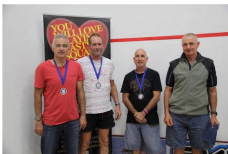
M60-64 Div 2