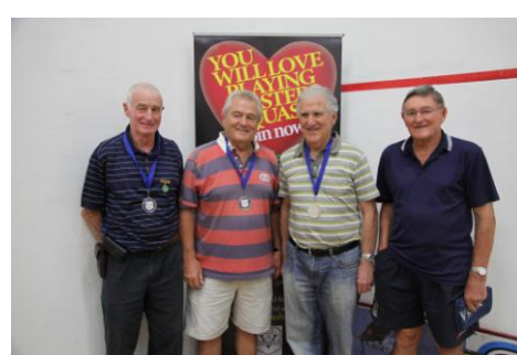
M 70-74 Open