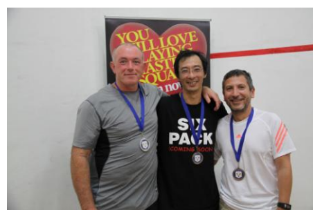
M 50-54 Div 2