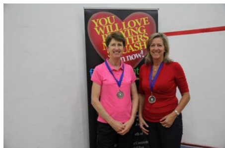
W 55-59 Open