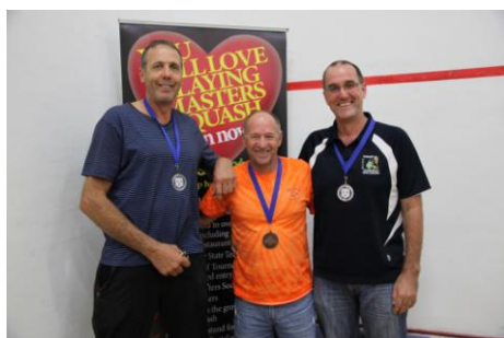
M 55-59 Open