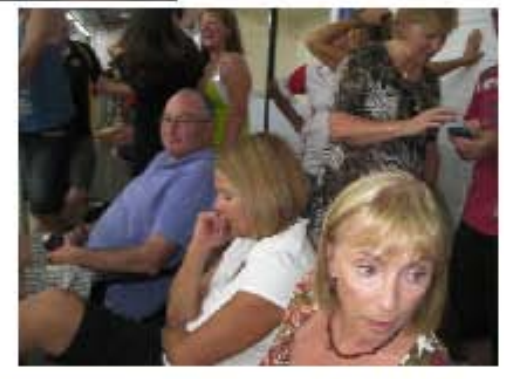
An unexpected cool off after being tossed in